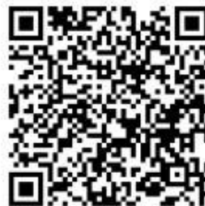
Week 2 Tennis Clinic

Active Kids Voucher Accepted All abilities welcome Suitable for ages 5 to 14 Experience not necessary